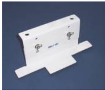
Universal Adapter Model 4050

Designed to fit all raised toilet seats that are bridge and arms ready.