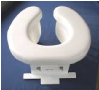
Universal Adapter Shown on Toilet seat