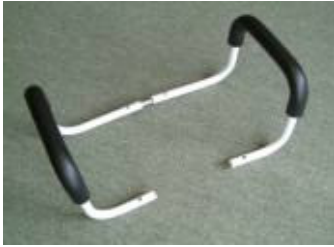
Padded R.T.S. Arms Model 4010