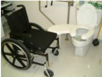
Wheelchair Bridge Model 4001TTB