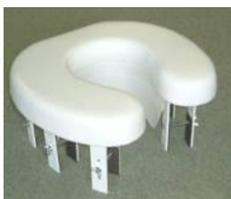
Model 4001 H.D.

Designed to fit Standard toilet bowls with out removing existing toilet seat. The Bariatric model has an extra large and wide surface to accommodate clients who need an extra large surface area. Constructed with 2-¾ inch of padding with a seamless vinyl coating on closed cell foam.